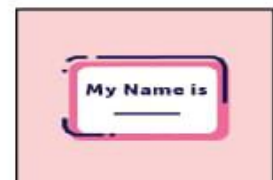
7. An Unislamic Name