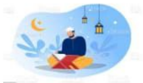
2. Learning Islamic Manners and Characteristics