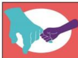
4. Protection & Security