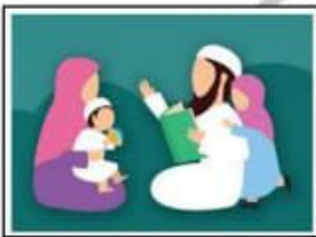
1. Not Spending Time with Parents