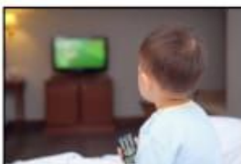
3. Free Browsing