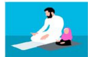
6. Learning to Be a Good Muslim